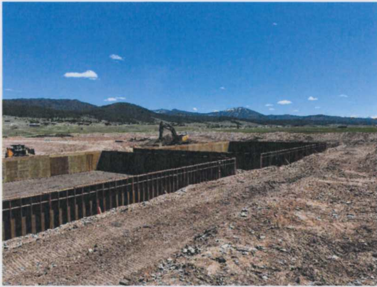
SAGR Bed Foundations