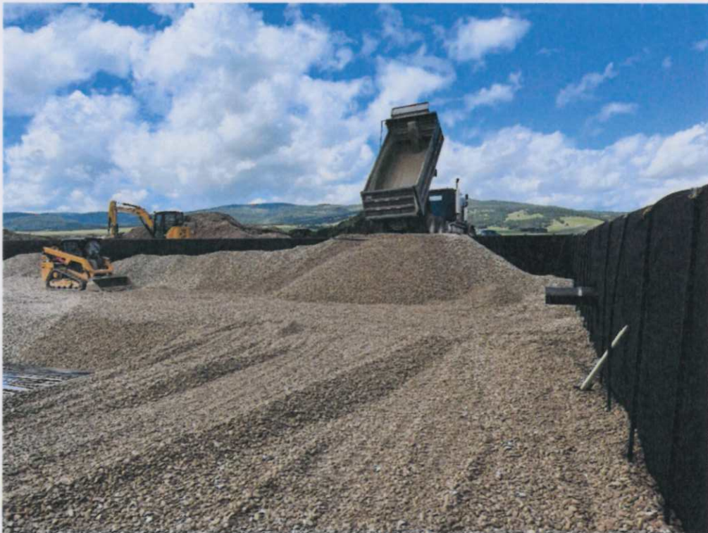
Placing Aggregate over SAGR Bed Liner