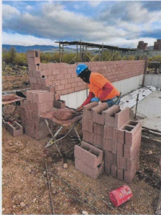
Constructing the walls of the UV building