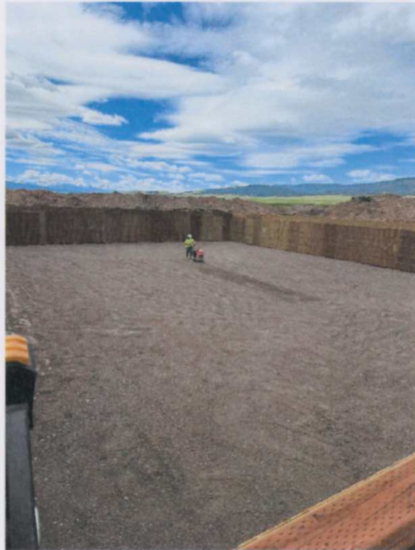
Floor of SAGR Bed