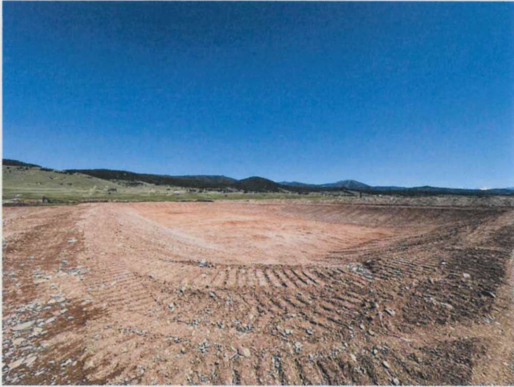
Lagoon Cell #1